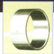
70C Series (Cover Used)